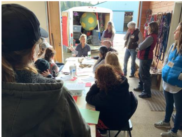
UGM Orientation Day, February 27, 2020

Most people who walk into addiction have no intention of becoming an addict. The reason many turn to drugs and alcohol, or any addiction, is often to numb or escape the pain of a loss or trauma. Every one of us was designed to be addicted to one thing and one thing only—our Savior Jesus Christ. When we turn to something less than our heavenly Father to meet our