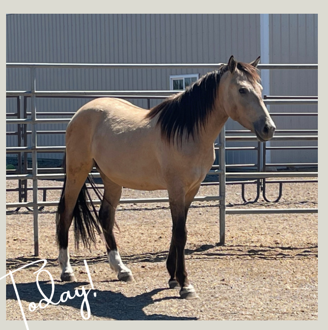
Se'Bo has been worked with by a handful of EMBRACE volunteers. He moves off of pressure, stands for the farrier, can be tied, and has a favorite scratch spot! He is also very curious!