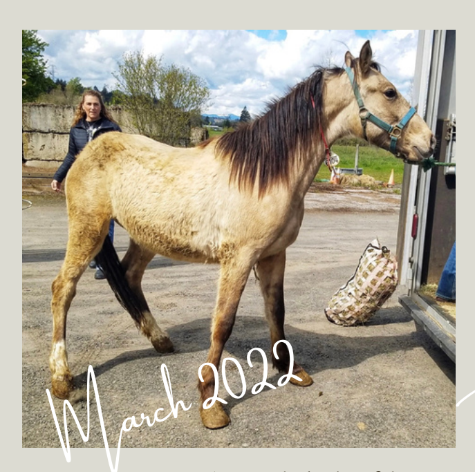
Se'Bo came to EMBRACE as the leader of the herd. He showed himself to be exceptionally smart, wary of people, and hesitant to make any kind of a connection that didn't involve him receiving treats!